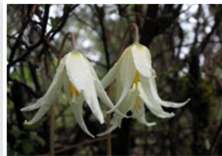
White Fawn Lily