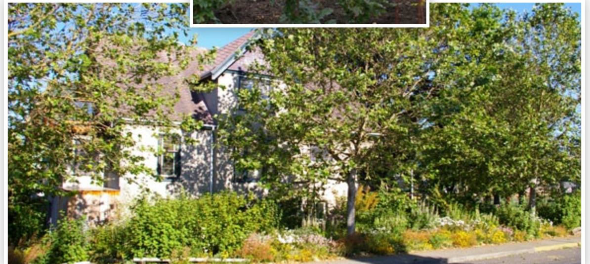
After image: Todd Doherty

of species but also a range of genetics for this garden. By 2010 the garden filled out nicely and received some cedar split rail fences to keep the neighbours and their dogs out of this beautiful landscape. Now