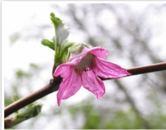
Salmonberry image: Agnes Lynn