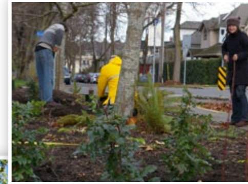
planting party

If you want to go check out this boulevard, turned native plant garden, walk by the corner