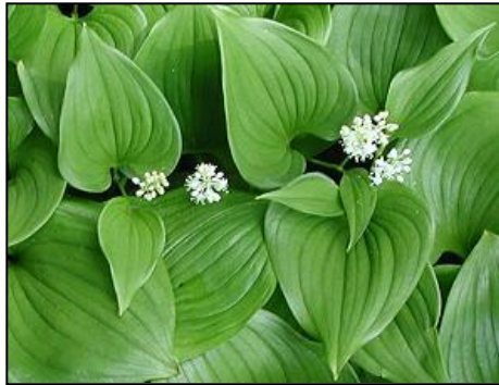
Maianthemum dilatatum

Notices of other events can be made by writing announcements on the blackboard or taping email messages to the wall. Arrive early to make sure everyone has a chance to read about your events during our break.