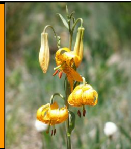
Liliium Columbianum