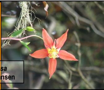
Aquilegia Foromosa