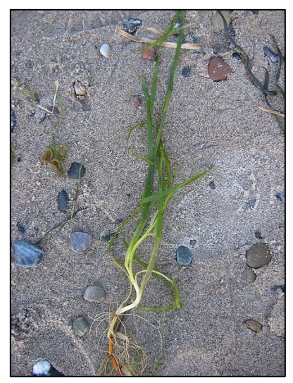
Zostera marina

Eelgrass is not seaweed; nor should it be confused with surf grass, which requires a rocky, wave-swept habitat. Eelgrass is found near the low tide line, is a bright green ribbon-like grass that produces roots, flowers, and seeds. Unlike surf grass, eelgrass has a preference for a gentle flow and a mixture of salt and fresh water. It thrives in the muddy sediments of sheltered bays along more than a quarter of BC's coast.