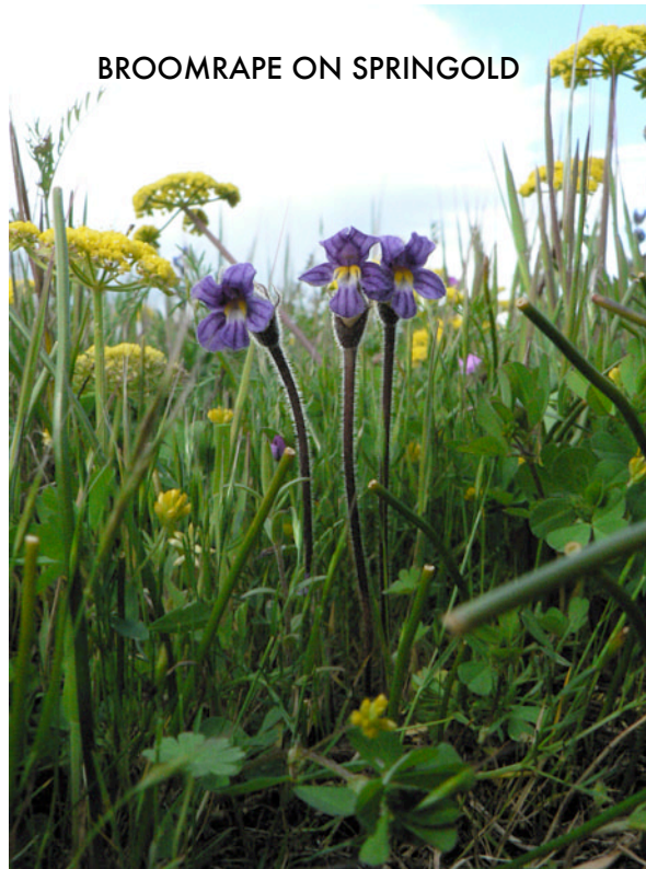
BROOMRAPE ON SPRINGOLD

Work each Sun. 9:30 - 11:30. Meet at Hampshire and Brighton, 2 blocks south of Oak Bay.